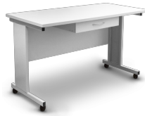
T-4L BS-040107-BK Table

New modular design of laboratory furniture provides flexibility and ease of use.