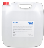
PDS-10L BS-040107-FK DNA/RNA Decontamination Solution 10l