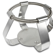
FC-1000 BS-010126-IK clamp