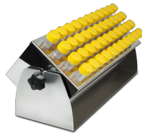
TR-44/15 BS-010135-LK rack

Double-sided adhesive strips. SPML is compatible with UP-168 platform, that fits both on PSU-20i orbital shaker and in ES-20/60 , ES-20/80 Shakers-Incubators.