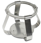
FC-250 BS-010126-JK clamp