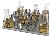
P-16/250 BS-010135-CK platform