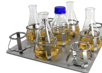
P-9/500 BS-010135-AK platform