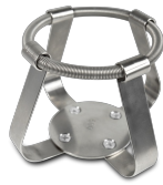
FC-500 BS-010126-LK clamp