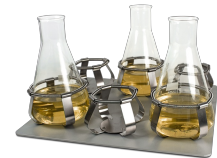
P-6/1000 BS-010135-DK platform