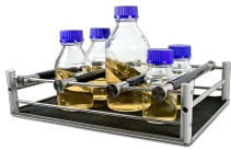
UP-330 BS-010145-AK platform

Universal platform with adjustable bars can accommodate laboratory glassware of different shapes.