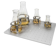
UP-168 BS-010135-JK platform

Flat platform with non-slip rubber mat can accommodate various low profile containers.