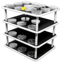
PP-20/4 BS-010126-EK platform

Flat platform with non-slip rubber mat can accommodate various low profile containers.