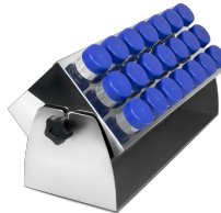
TR-21/50 BS-010135-KK rack

Adjustable angle test tube rack for UP-168