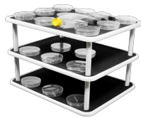
PP-20/3 BS-010126-BK platform

Flat platform with non-slip rubber mat can accommodate various low profile containers.