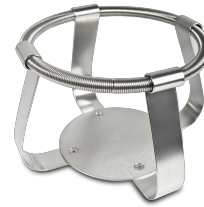
FC-2000 BS-010126-NK clamp