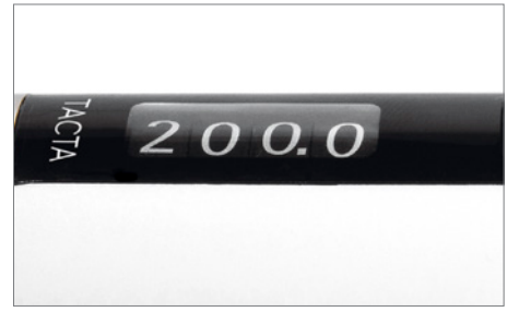
The volume is easy to read even when the pipette is angled.

The large, easy-to-read display helps you to see all four digits of the set volume from a distance without straining your eyes. The volume is easy to read even when the pipette is angled – eliminating the need to turn your head into an uncomfortable position.